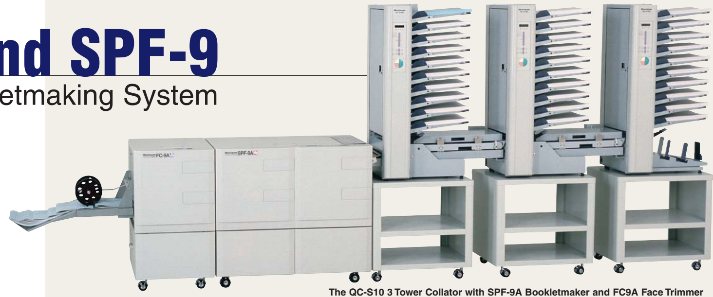
The QC-S10 3 Tower Collator with SPF-9A Bookletmaker and FC9A Face Trimmer

The QC-S10 Collator and SPF-9 Bookletmaking System from Standard offers simple operation, exceptional performance and professional results. The modular design of the system allows the flexibility to expand with additional components as production needs grow. The QC-S10's innovative 10, 20 or 30 station expandability, exceptional speed and quality construction will provide years of superior productivity and reliability.