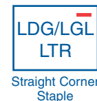
Straight Corner Staple