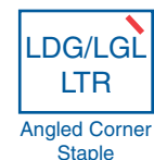
Angled Corner Staple