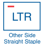
Other Side Straight Staple