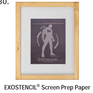
EXOSTENCIL® Screen Prep Paper