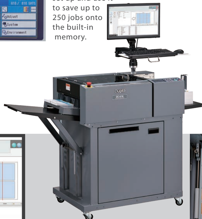
DC-618 shown with optional PC and PC arm.

to save up to 250 jobs onto the built-in memory.